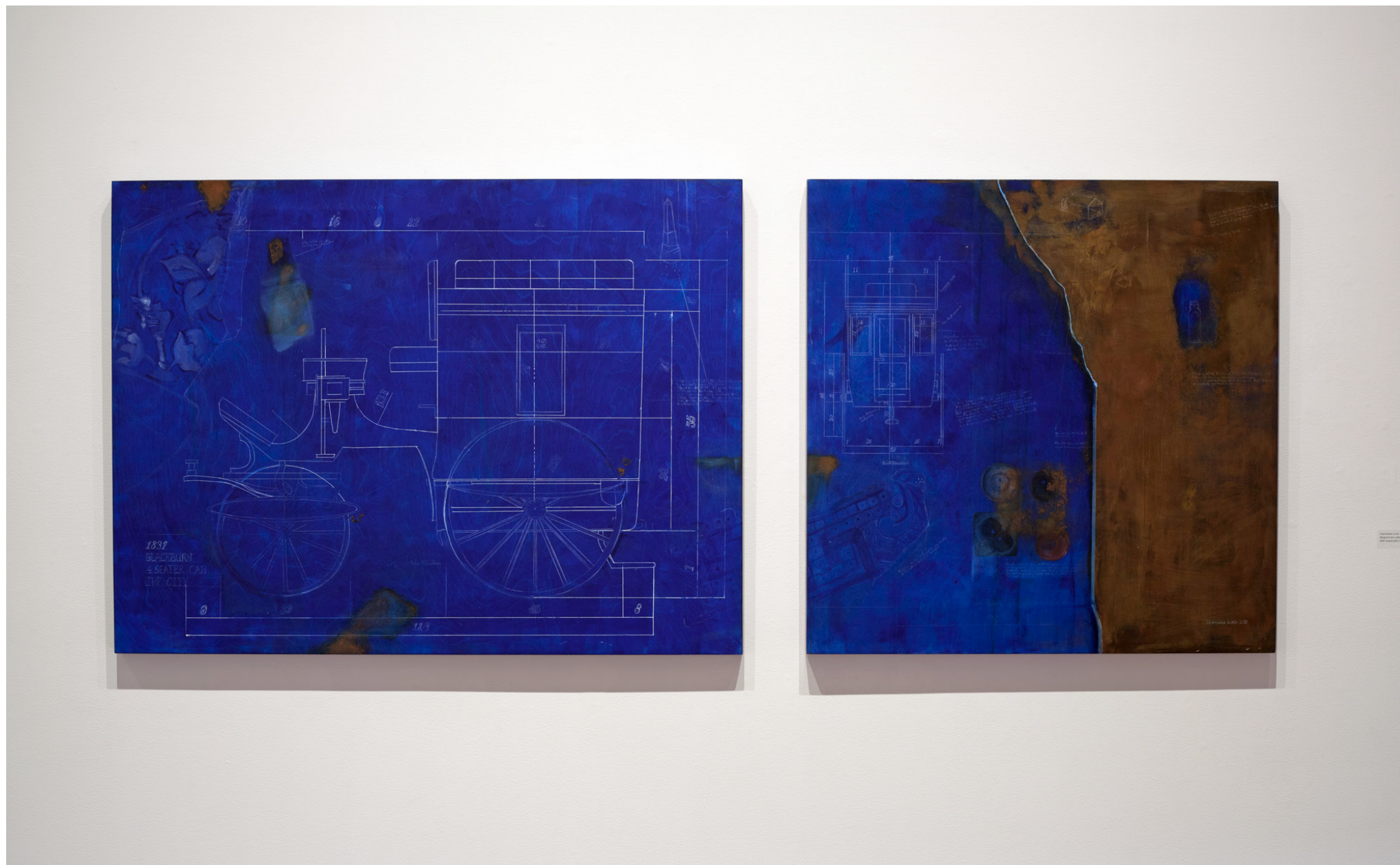
Charmaine Lurch, Detail of Blueprint for a Mobile and Visible Carriage , 2017/2018, MDF board with rusted metal patina.