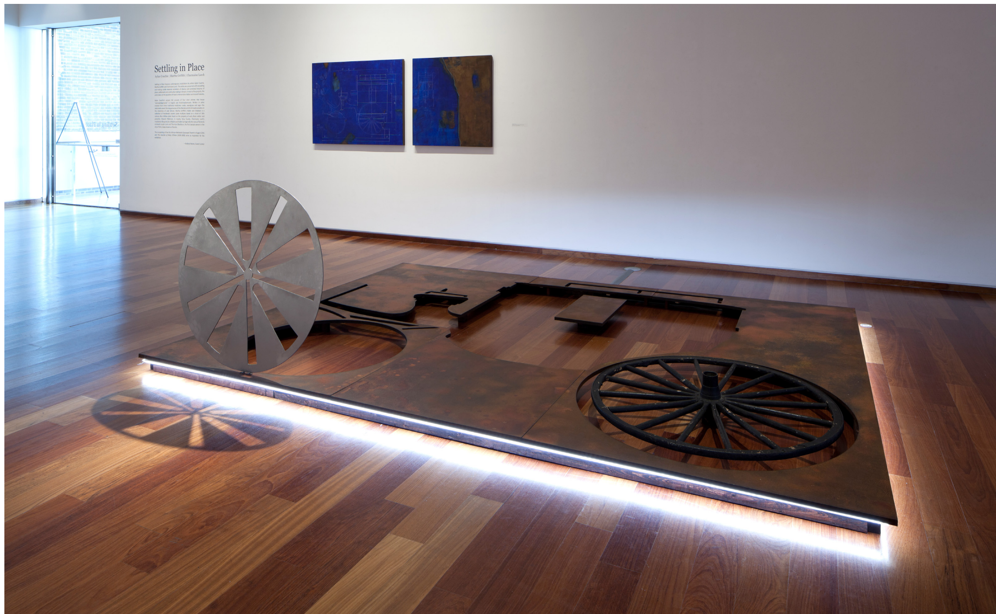
Charmaine Lurch, Blueprint for a Mobile and Visible Carriage , 2017/2018, MDF board with rusted metal patina.