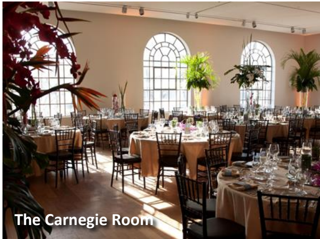
The Carnegie Room