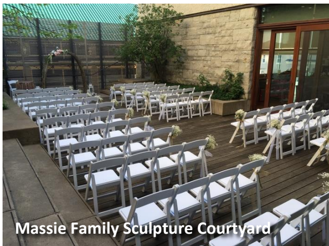
Massie Family Sculpture Courtyard