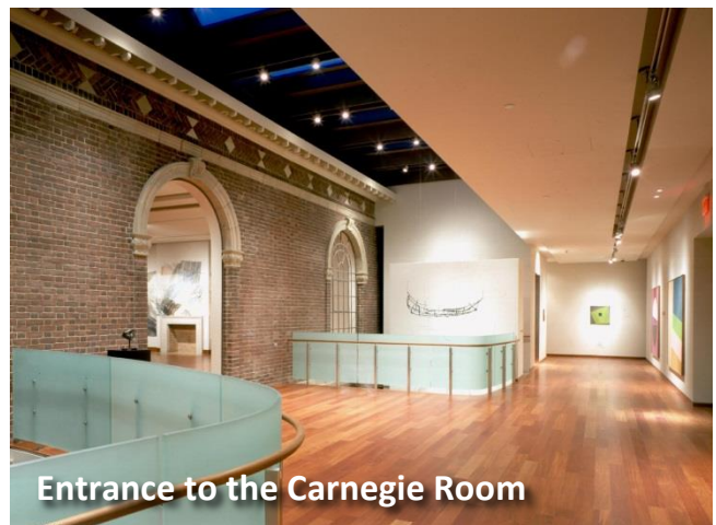
Entrance to the Carnegie Room