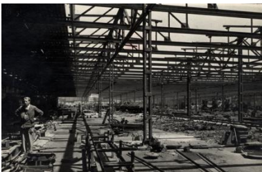
3018: Anonymous photographer, The Stalingrad Tractor Plant , gelatin silver print, n.d.

And yet people worked. Each day tens of thousands of bricks were laid and new walls rose up from the ruins.