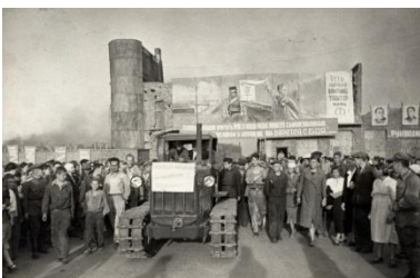
2988: Anonymous photographer, the First Tractor , gelatin silver print, n.d.

The results of many months of intense work. For the first time since the Germans attacked the city, motors are again humming in the rehabilitated shops of the Stalingrad Tractor Plant. They passed their tests with flying colours.