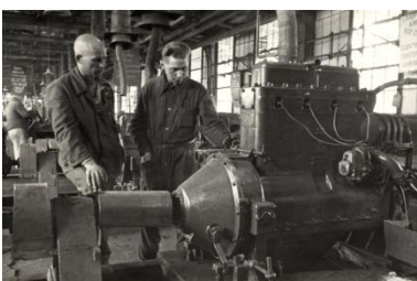
2989: Anonymous photographer, Stalingrad Tractor Plant , gelatin silver print, n.d.

All preliminary work for installing the main conveyor has been completed.