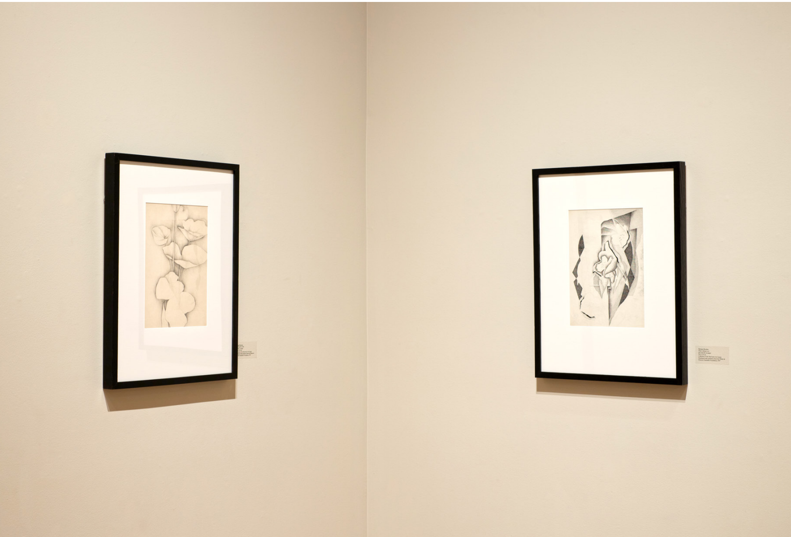
Installation view of Bertram Brooker: This Tremendous Arc , MacLaren Art Centre, 2019.