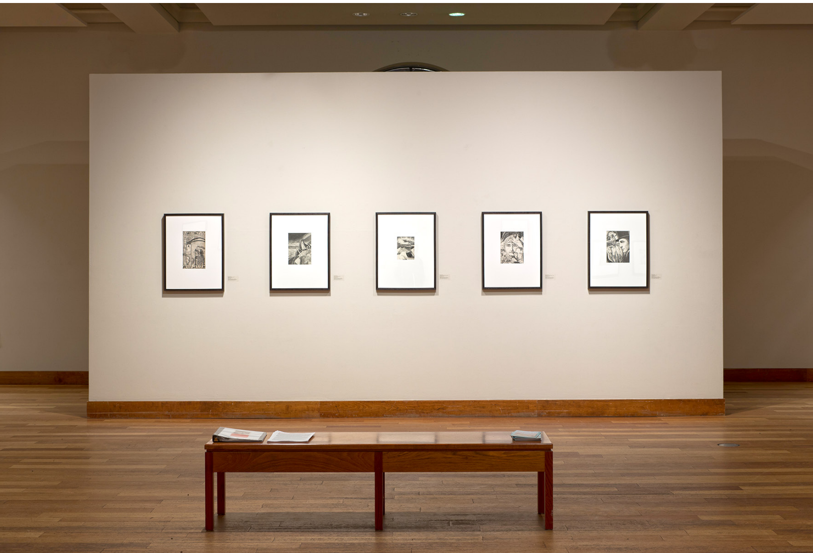
Installation view of Bertram Brooker: This Tremendous Arc , MacLaren Art Centre, 2019.