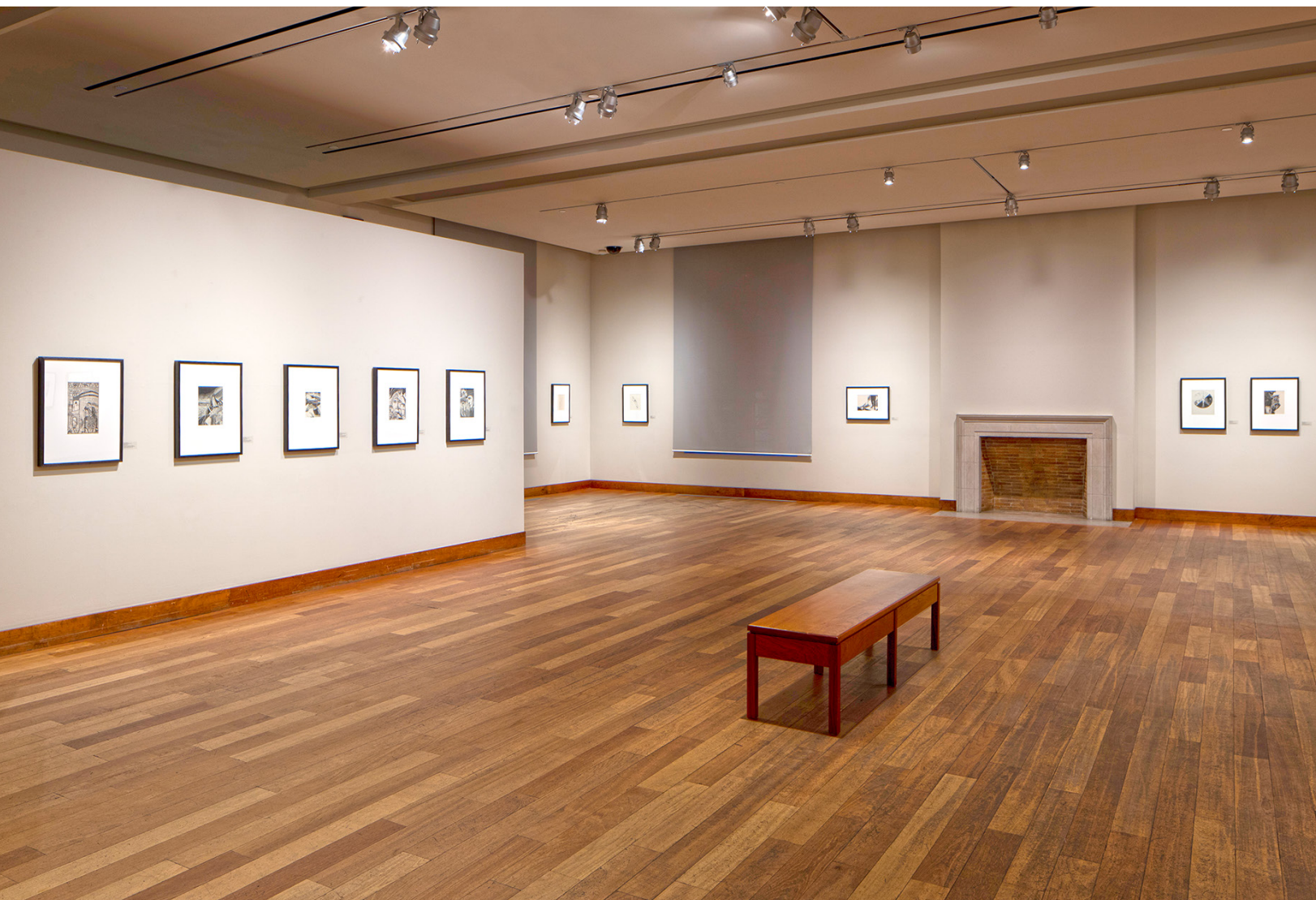
Installation view of Bertram Brooker: This Tremendous Arc , MacLaren Art Centre, 2019.